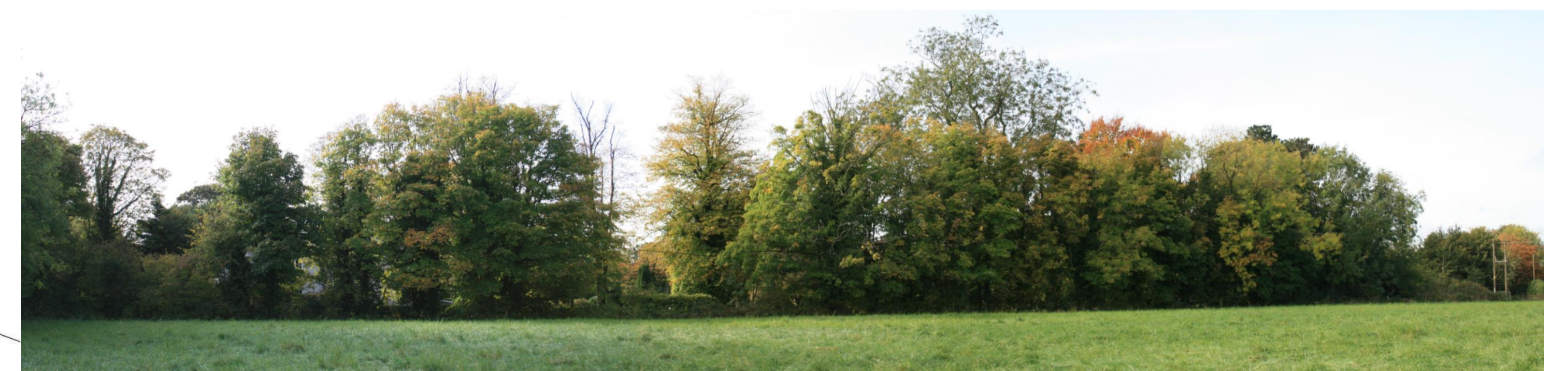
Southern Boundary of the Site.