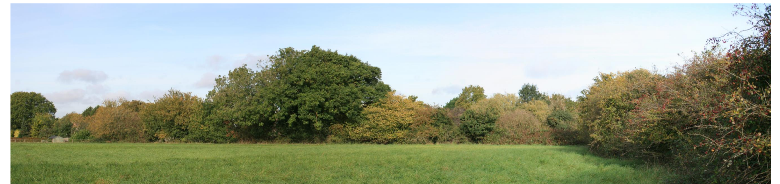
Northern Boundary of the Site.

Our architects have undertaken an analysis of the site opportunities and constraints, they have identified key development principles for the Site as set out below.